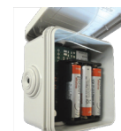
Wired Air T° / Humidity probe