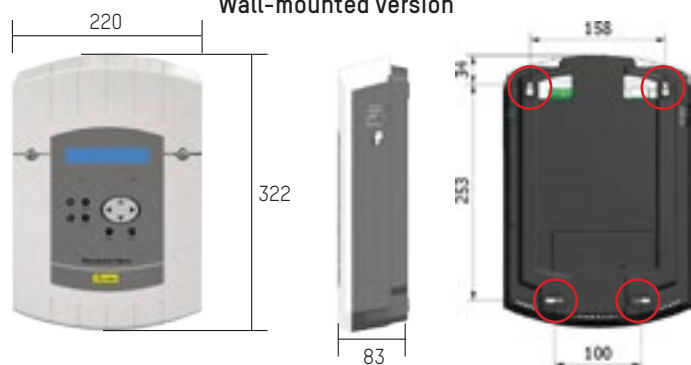
Weight: 1.2 Kg - Wall mounting with 2 screws.