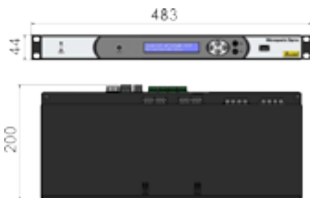
1U rack version